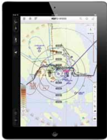
At-a-glance distance measurement tool adjusts based on your zoom level.