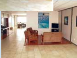
The well-appointed lounge and crew rest area

TASC can arrange island tours, rental cars, yacht charters and transfers to any of the other islands. The TASC ramp, which is located on the north side of the field, can accommodate up to A320-size aircraft. The TASC facility is a comfortable, convenient and discreet option for corporate travelers in French Polynesia. ■