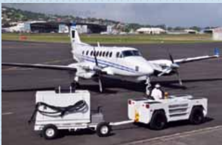
The TASC ramp can easily accommodate most business aircraft

The Robert Wan Company has opened Tahiti Air Service & Concierge (TASC), the first full service FBO at Faa'a Airport (NTAA). This significant development for the hub of the French Polynesian islands means operators have access to 24/7 service, fuel (avgas and jet), full ground support and VIP concierge services with a comfortable passenger lounge. Crews have a separate lounge with Internet access and shower facilities. Customs and immigration are cleared on site, and hangar space is available with emergency maintenance assistance if needed.