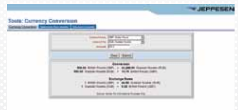
Exchange rates are built right in to the Trip Planning System Web Portal

Functionality to look-up currency exchange rates has recently been created in the Web Portal as well. You can input the desired currencies and a monetary amount in order to find the equivalent value from one currency to the other. The results also include the respective exchange rates between the two currencies and an automatic reverse look-up.