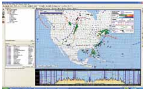
FliteStar 9.5—flight planning with enhanced weather features

While mobile apps have stirred tremendous interest recently, the introduction of FliteStar version 9.5 with enhanced global weather data service has been met with great anticipation, too.