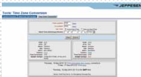
Time zones are a snap with this new conversion tool

A new tool set offers applications that are useful in the pre-planning phase of a trip. Such as the ability to look-up the Local and GMT times for airports around the world using either the current time or a user-specified date and time. The results also include the time conversion factor between Local and GMT times for both airports.