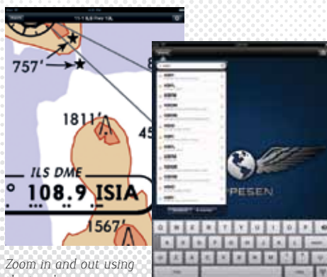
Zoom in and out using the touch screen

Existing JeppView customers can access Jeppesen terminal charts through the new iPad app at no additional charge, using one of four available site keys provided with JeppView and NavSuite subscriptions. If all four subscription site keys are currently in use, an additional site key purchase would be required.