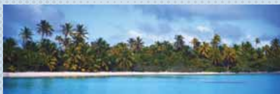
French Polynesia is a truly spectacular destination

TASC can arrange island tours, rental cars, yacht charters and transfers to any of the other islands. The TASC ramp, which is located on the north side of the field, can accommodate up to A320-size aircraft. The TASC facility is a comfortable, convenient and discreet option for corporate travelers in French Polynesia. ■