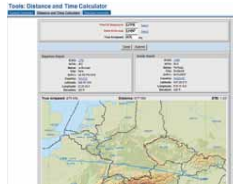
Does the boss want to know how long and how far?—that's easy with the distance and time calculator

Another useful feature is the ability to calculate the distance between two airports. You also have the option to input a true airspeed in order to get a basic ETE. The distance is outputted in nautical miles and the route is plotted graphically over a Jeppesen enroute chart. General information about both airports is provided as well.