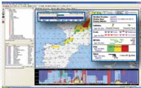
New chart time slider and weather legend

With FliteStar 9.5 users now have continuously updated weather information for improved situational awareness while flight planning. Weather data is presented through multiple customized graphical formats displayed according to FliteStar coverage area, user preference and flight plan. You get a dynamic graphical view of the weather environment in both enroute and profile views, reducing the need to switch between multiple screens. Jeppesen weather data now aligns with your FliteStar coverage area and weather download overlay displays are presented on enroute charts and are updated automatically through an Internet connection.